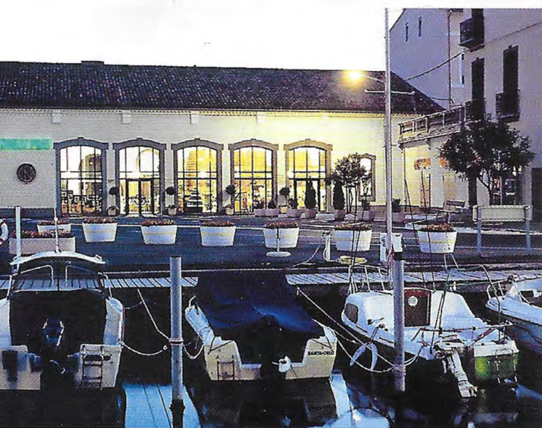
Enjoy beautiful sunsets and the chance to relax in your own pool at La Baraquette (right). The picturesque harbour town of Marseillan (above) offers visitors plenty to do both day and night