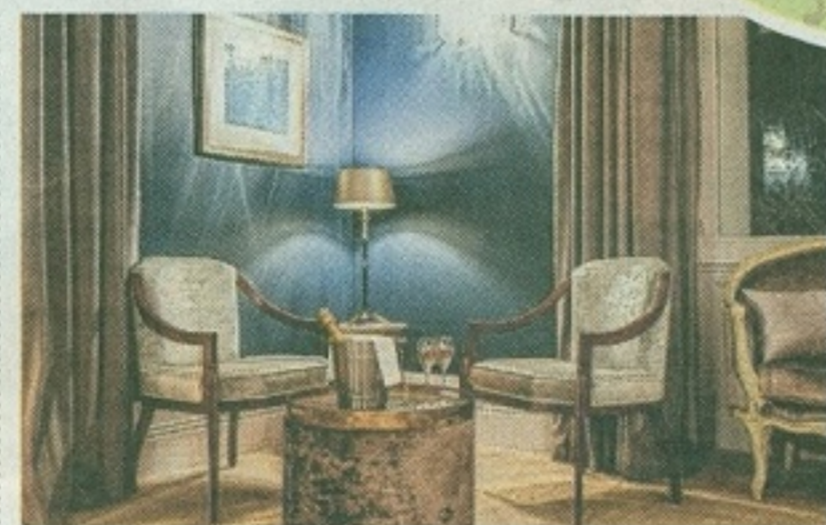
Sparkling company Bubbles in the lounge

I had, in truth, been confident the moment we turned in through the gates, which opened this spring. A straight drive flanked by infant cypresses divided the vines. The wine master's 19th-century chateau stood at the end, yet the style was formally informal, not feudal.