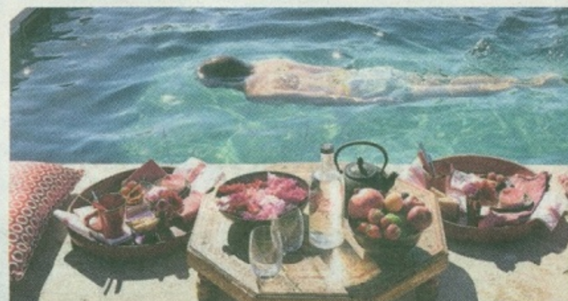
Poolside at Château Castigno, in the St Chinian hills

DOMAINE DE VERCHANT, OUTSIDE MONTPELLIER Five-star contemporary elegance, a glamorous poolside scene, a bar, a couple of restaurants and a spa, all slotted into a manorial wine domaine at the gates of France's most desirable city: what could possibly go wrong? Doubles from £191; domainedeverchant.com