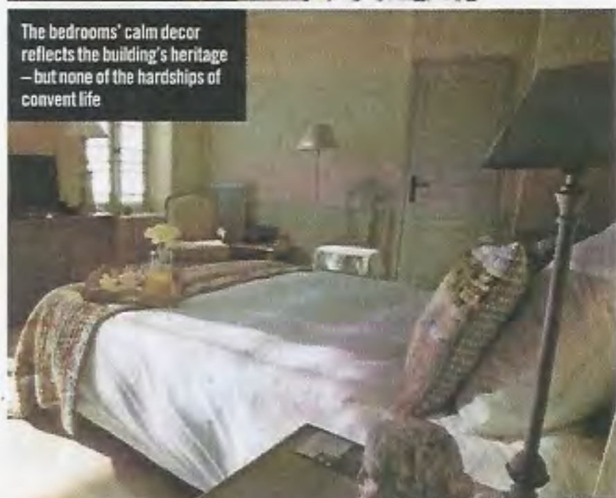
The bedrooms' calm decor reflects the building's heritage – but none of the hardships of convent life

THE FACTS Le Couvent d'Hérépien, Hérépien, costs from £107 per suite per night, two sharing (00 33 46711 8715, www.garrigaeresorts.com/le-couvent ). Ryanair flies from Stansted to Carcassonne from £51.62 return ( www.ryanair.com ).